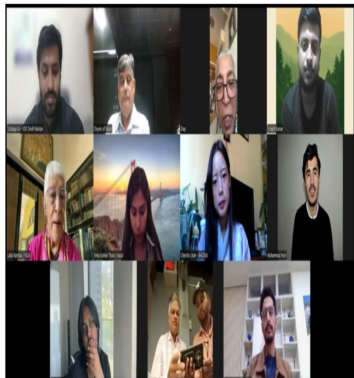
SAARC Charter Day 8 th December 2025- Live Streaming